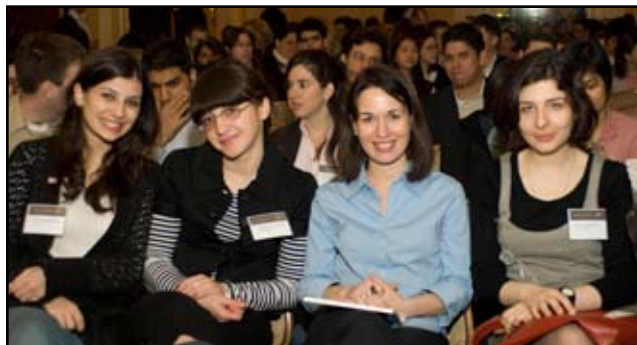
Above, students attend the mandatory Orientation Meeting at the International Rounds of the Jessup Moot Court Competition. Prior to the meeting students took part in the Orientation Fair.

All advertisement copy must be submitted electronically in .pdf or .jpg format to vshen@ilsa.org.